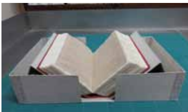
A conserved book kept in a book cradle