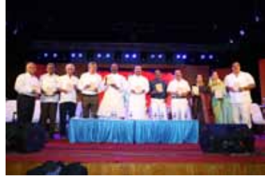
Chief guests with the books