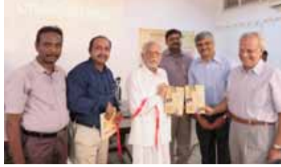
Dr. Iravatham Mahadevan releasing the book