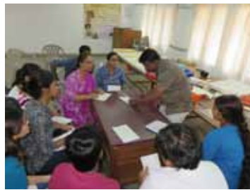
Participants in the conservation workshop