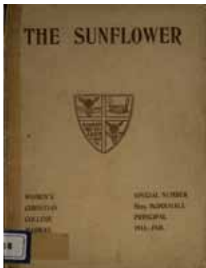
Cover page of a Sunflower magazine issue

Regarding preservation of institutional material, magazines of Madras Christian College (MCC) and Women's Christian College (WCC) have been digitized this year. 83 issues of Sunflower magazine (WCC magazine) and 126 issues of MCC magazines were digitized.