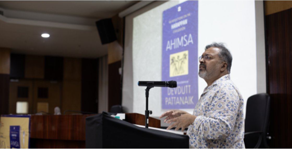
Mr. Devdutt Pattanaik