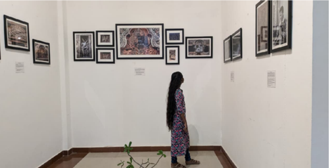
Comparative Iconography photo exhibition