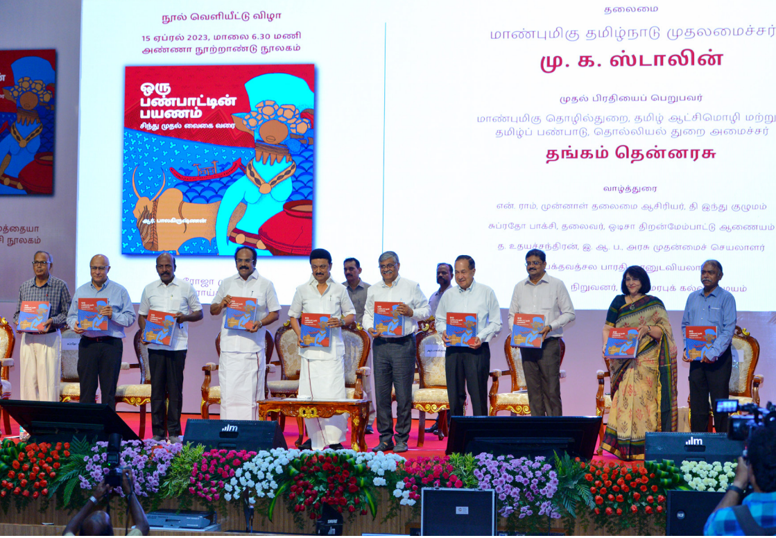
'Oru Panpattin Payanam' Book launch