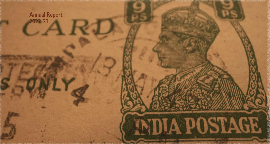
Image of a postcard from RMRL Collection