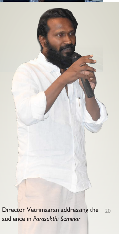
Director Vetrimaaran addressing the audience in Parasakthi Seminar