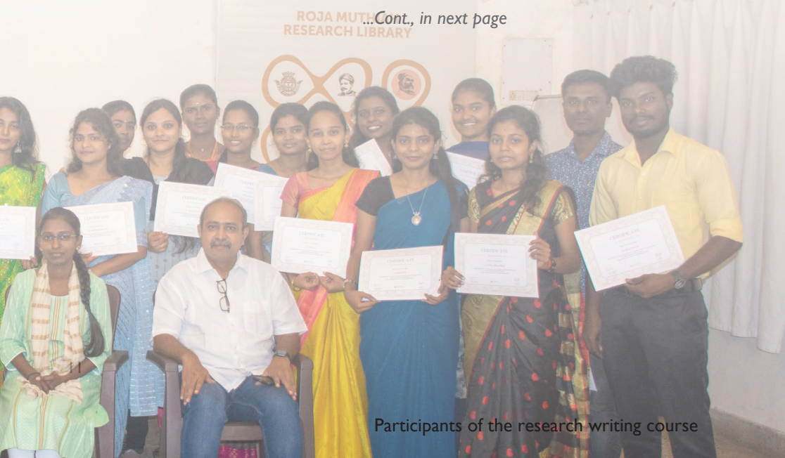
Participants of the research writing course

Government of Tamil Nadu State Planning Commission, Government of Tamil Nadu Anitha Texcot Pvt. Ltd. DRA Aadithya South City Projects Pvt. Ltd. Manpro Equipments Pvt. Ltd. Pace Builders (M) Pvt. Ltd. PST Engineering Construction Raja Charity Trust Rajparis Civil Constructions Ltd. RPP Selvam Trust Saint Gobain India Foundation Sakthi Devi Charitable Trust SAS Hotels and Enterprises Ltd, Sri Balaji Traders Sri Vigneshwara Educational Trust The Ramco Cements Ltd. Tube Investments of India Ltd. URC Constructions