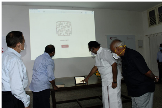
Hon'ble minister Mr. Thangam Thennarasu launching the portal