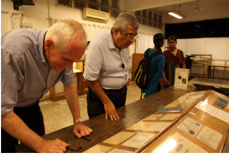
visitors at the Exhibition