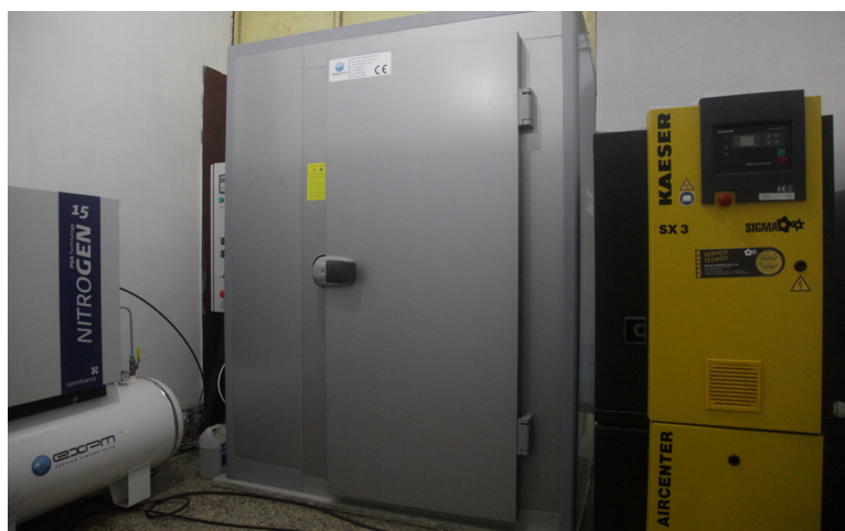
Nitrogen disinfection system

With the fund received from Navajbai Ratan Tata Trust for the major paper conservation project a full fledged conservation studio was setup at RMRL this year. Equipments such as nitrogen disinfection system, leaf casting machine and tools to undertake this paper conservation