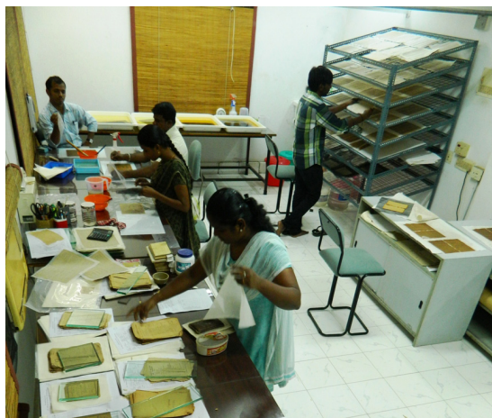
Staff in conservation studio

With the fund received from Navajbai Ratan Tata Trust for the major paper conservation project a full fledged conservation studio was setup at RMRL this year. Equipments such as nitrogen disinfection system, leaf casting machine and tools to undertake this paper conservation programme were purchased from Europe. With the conservation studio in place processes for carrying this work for Indian condition were experimented and developed. In the first year around 30,000 pages from the carefully selected list of books from RMRL collection have been conserved.