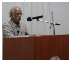
Dr. Iravatham Mahadevan. delivering a lecture

14 November 2014: Dravidian Proof of the Indus Script via the Rig Veda: A Case Study by Dr. Iravatham Mahadevan. The paper was published as 4th volume of the bulletin of the Indus Research Centre and was release the same day before the lecture.