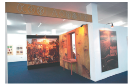
Indus Exhibition by IRC, RMRL at WCTC

In June 2010, the Indus Research Centre was invited to organize an exhibition on the Indus Valley Civilization as part of the World Classical Tamil Conference held in Coimbatore. This was the largest exhibition organized by IRC to date. The 2,000 square foot exhibition hall featured a to-scale replica of the Great Bath of Mohenjodaro, a model of a harappan well built with wedge shaped bricks, replicas of Indus pottery, seals, terracotta toys, weights and figurines, and more than 60 panels covering the salient features of the Indus Valley Civilization, and the likely link between the Harappan and Dravidian languages. In addition, artists' rendering of a scale model of Dholavira Entranceway, a Harappan City scene, and the Granary of Mohenjodaro were also depicted. A computer touch screen-based (kiosk) quiz program, specifically designed to test the understanding of the Indus Valley Civilization of school children, was also organized.