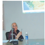
Prof. Romila Thapar delivering lecture