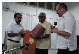
Seminar on 'Future of Early Tamil Cinema'