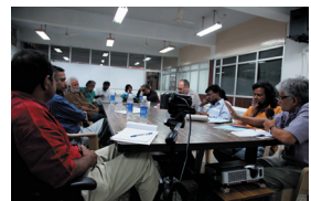
Panel discussion at Seminar on ‘Future of Early Tamil Cinema’